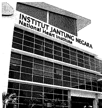
IJN - National Heart Institute of Malaysia