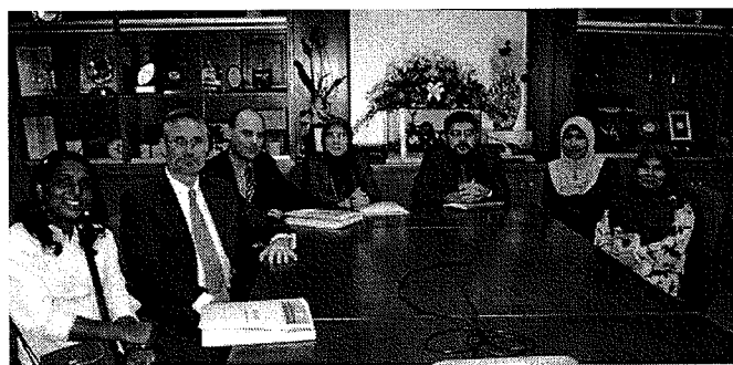
Discussion with the Team from Pusat Darah Negara (PDN) National Blood Center