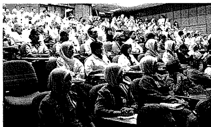
Patient Blood Management Lecture at the IJN National Heart Institute of Malaysia